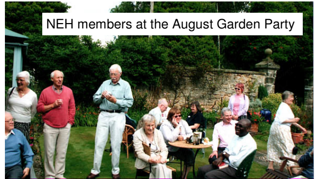
NEH members at the August Garden Party

A total of £153.70 was raised for NEH funds from a raffle and a successful bring and buy sale.